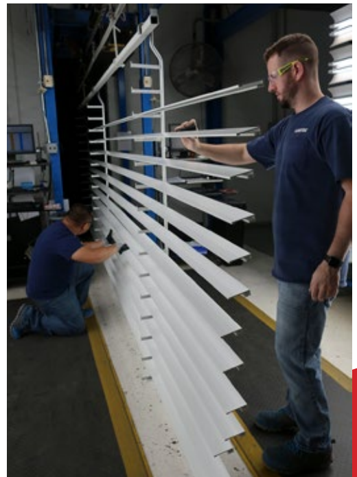
Linetec®, one of Major's finishing partners, is a leader in finish applications and is also based in Wausau, WI.