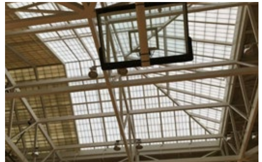
Replacement of Competitor's Weathered Skylight System